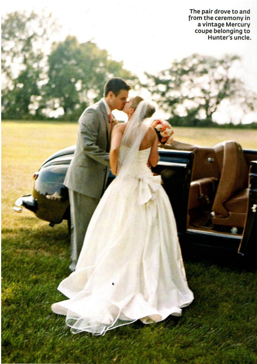
The pair drove to and from the ceremony in a vintage Mercury coupe belonging to Hunter's uncle.