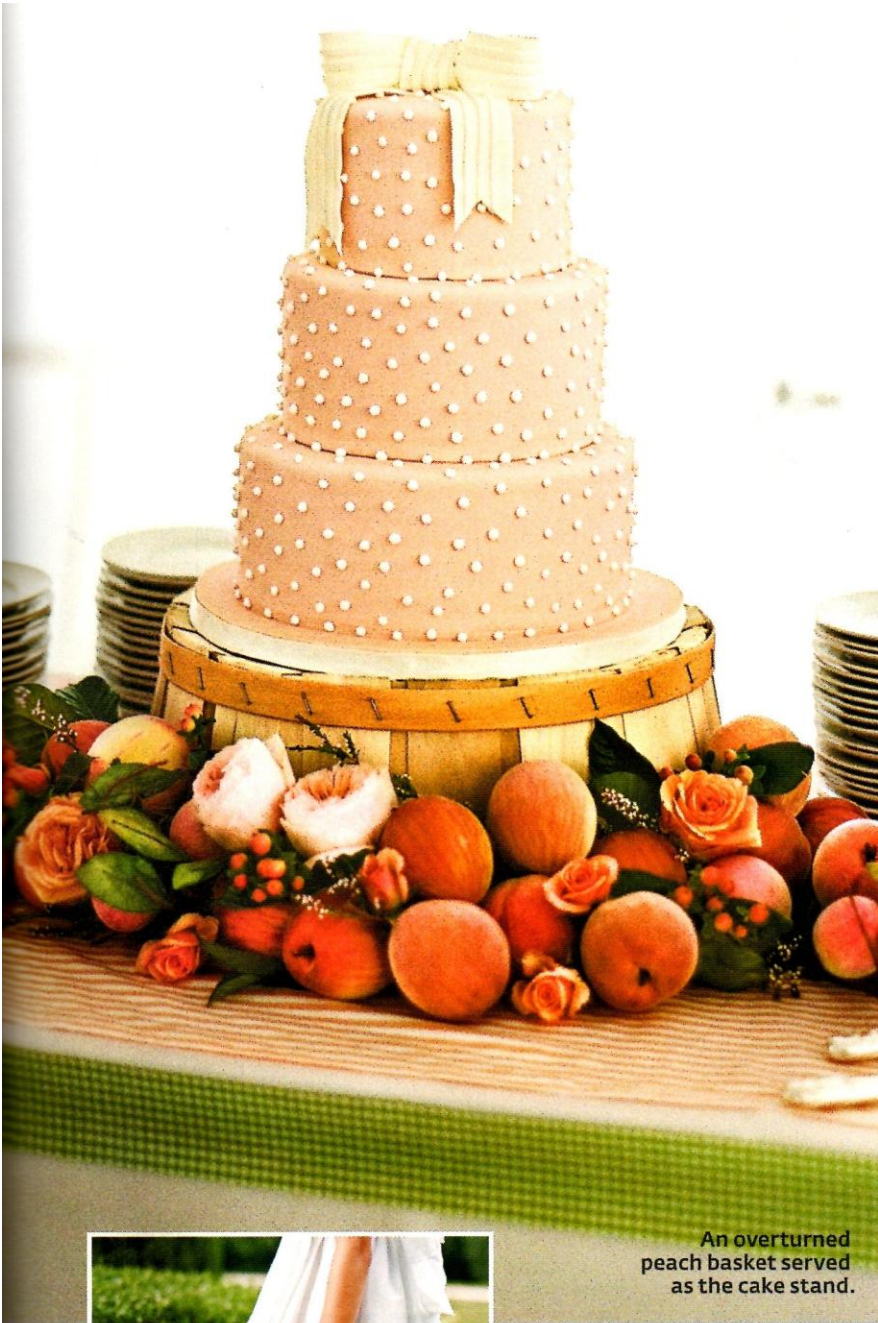
An overturned peach basket served as the cake stand.